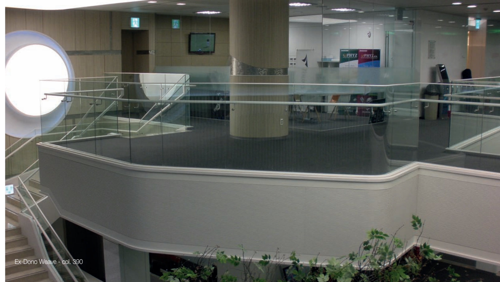
Ex-Dono Weave - col. 390