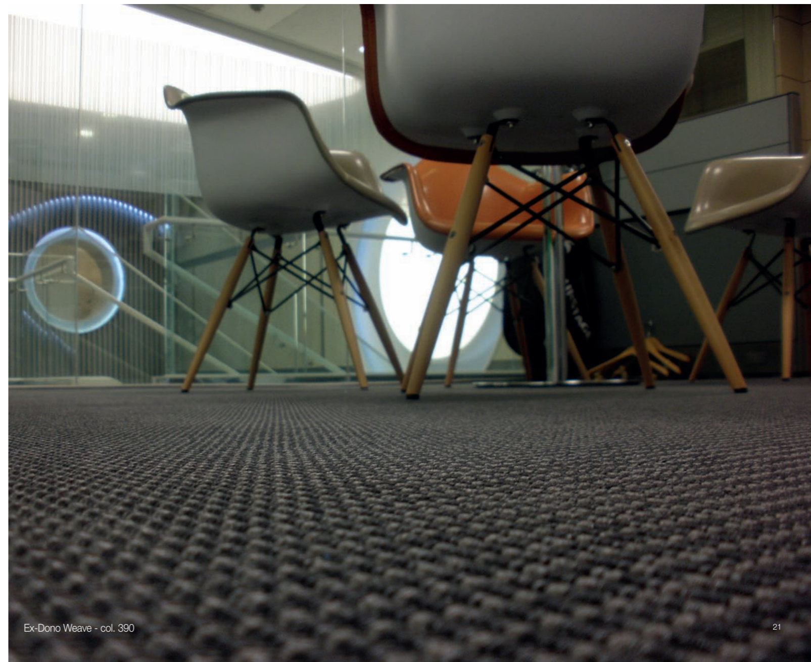
Ex-Dono Weave - col. 390